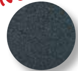
Closed Cell Foam Rubber