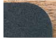
Closed Cell Foam Rubber