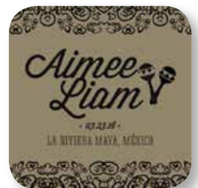
Square with rounded corners